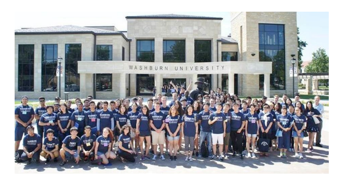
Washburn International Students - Fall 2016.

Fall 2016 saw the second largest enrollment of international students in Washburn's history. We are working to diversify our student population with more underrepresented countries and regions.