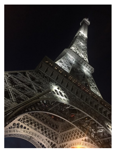
Soaking in the Eiffel Tower.