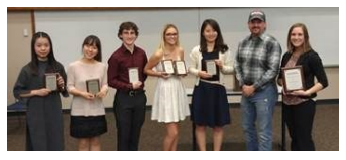
2016 Fall Nall top six competitors.

The 2016 Fall Nall Speak Off was held by Washburn University's Communication Department. Each semester, the top one to three speakers are selected from each Washburn University public speaking course to represent their respective classes in this competition. Three international students placed in the top six finalists: