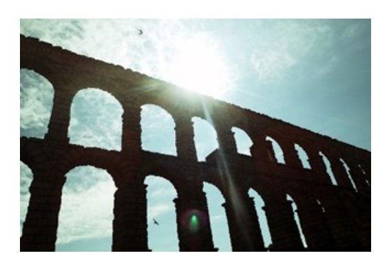
An impressive and very old Aqueduct in Segovia that was built by the Romans in around 50 A.D.