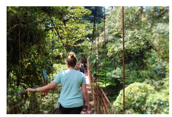
Exploring Costa Rica.